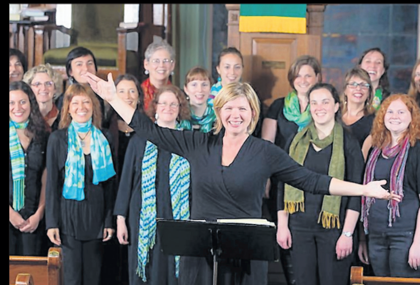
Above, the Step on Stage show choir from Scottsdale, Arizona, will sing "Rhythm Nation" and other tunes. At left, the Bella Voce singers, a Brooklyn ensemble, will sing "Anne Frank: A Living Voice."