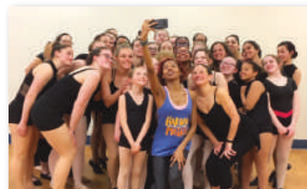
Meet-The-Artist Workshop: The Lion King